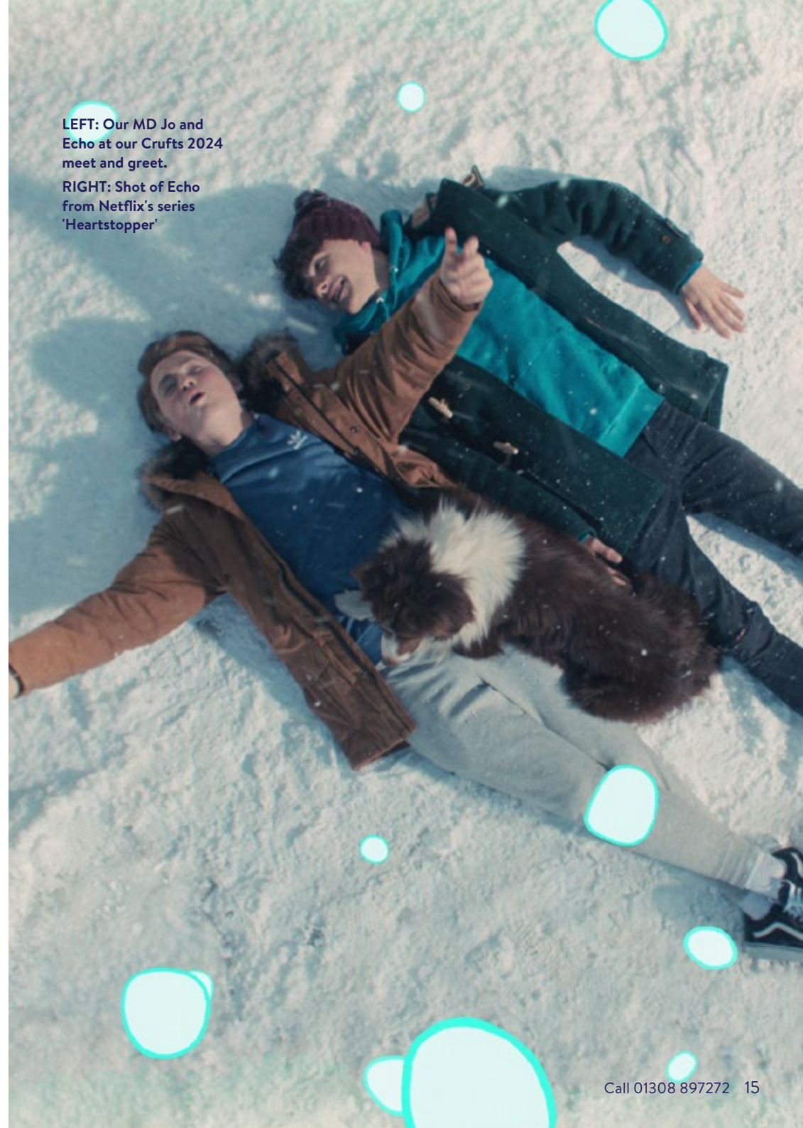
RIGHT: Shot of Echo from Netflix's series 'Heartstopper'